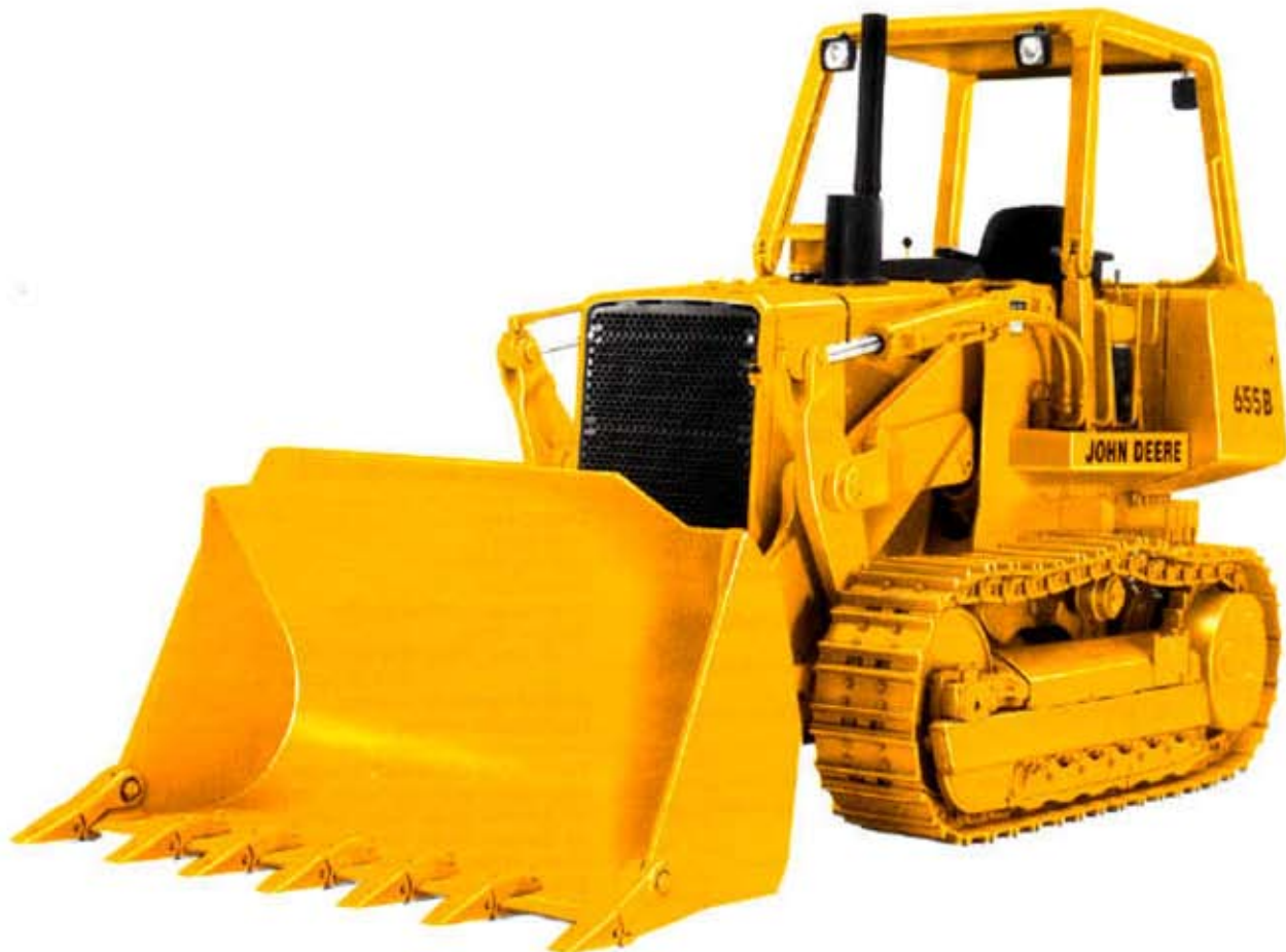
Model shown may include options