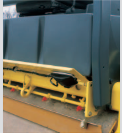
Wind protected spray nozzles for even drum coverage