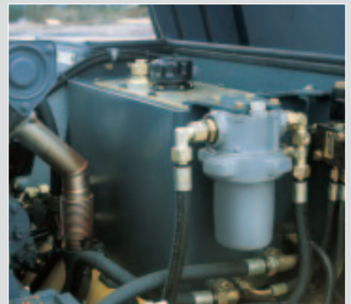
Easily accessible components for fast maintenance

With these features and many more, it's easy to see why this model maintains a high residual value while delivering lower lifetime operating costs.