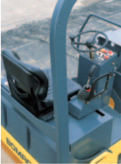
Ergonomic control layout for simple operation