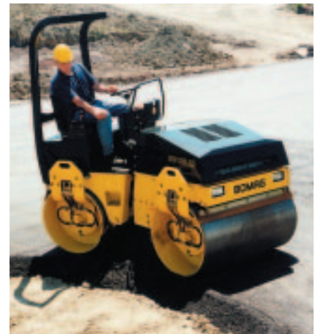
BW135AD in action on asphalt