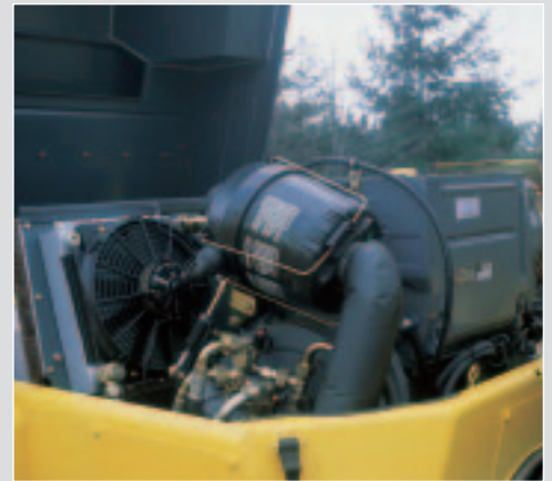
The powerful diesel engine has low maintenance costs