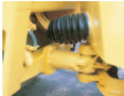
The bolt-on oscillating, articulation joint is designed for long life even in tough site conditions