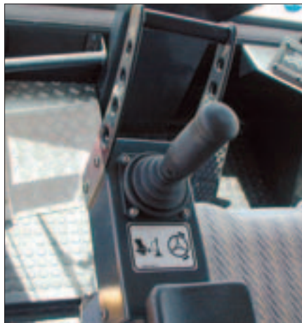
Ergonomic control layout including joystick steering control.