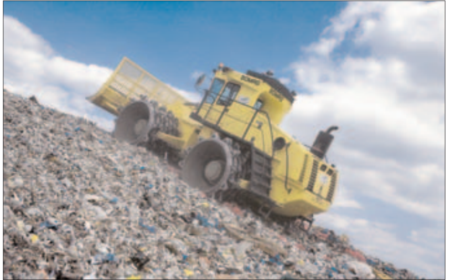
4-wheel hydrostatic drive system is capable of 100% gradeability, 45° slopes

Normal operating conditions of a landfill site place extreme demands on the drive system of a refuse compactor. Pushing and spreading waste requires maximum torque and power; compacting in either forward or reverse direction on the working face demands highest tractive effort. The BC972RB/ BC1172RB combines the efficient engine horsepower utilization of a hydrostatic drive system with 4 independent wheel drive motors to meet the challenges faced by a refuse compactor and to provide greater tractive effort regardless of operating conditions.