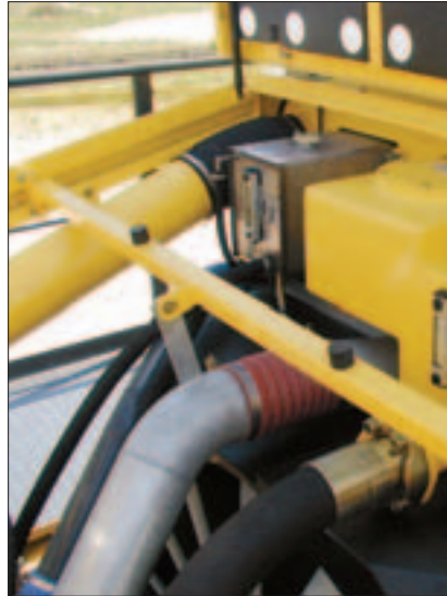
Easy access to the engine compartment and hydraulic components area through hinged access doors.